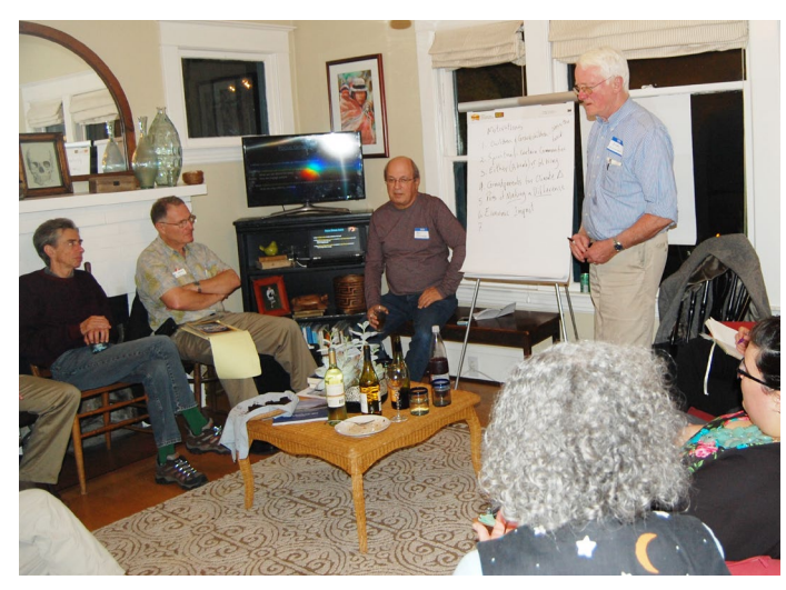
Stewardship conversations spark dialogues about the greatest challenges facing coming generations, and ways we can make a difference.