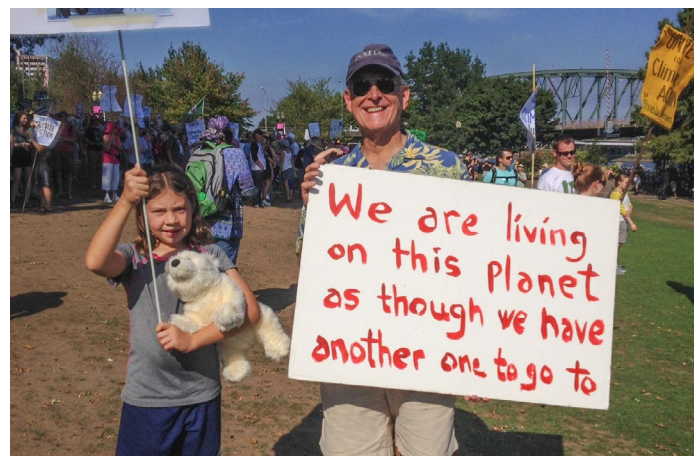
Advocates are encouraged to join together and march in support of action on climate change.

To date, we have also published ten stories about our Sages—exemplary volunteers who champion local causes and who are available as mentors. These Sages demonstrate the many ways that older adults can give forward by serving as board members, training young adults, forming giving circles, and influencing policy.